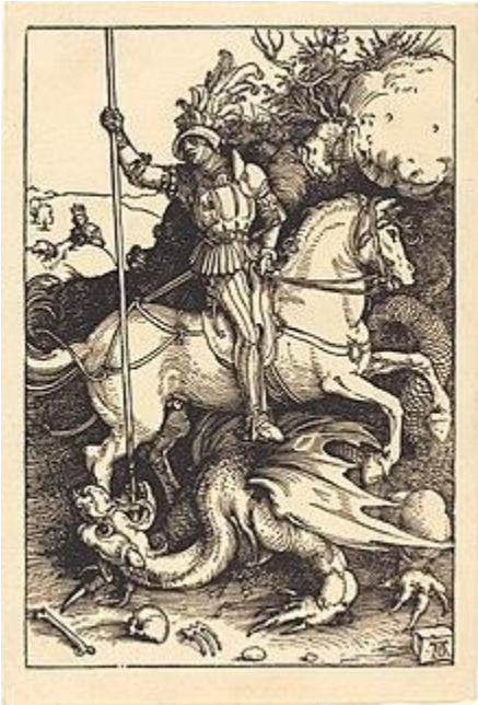
[Image: Albrecht Dürer - Saint George Killing the Dragon (NGA 1943.3.3597) - Saint George and the Dragon - Wikipedia ]

When you learn that dinosaurs died after the flood of Noah, you wonder how they lived among humans before then, if any were on the arc, and if any thereby survived the flood and lived, at least for a while, before being killed off, among modern man.