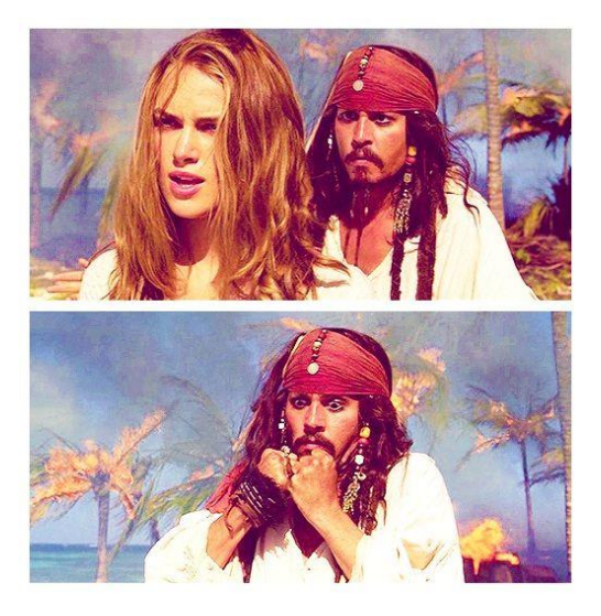
(Scenes from "Pirates of the Carribean")