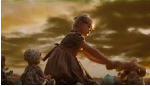
Monkey throws weapon / Primitive girl throws baby: